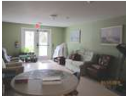
The green room with access to the back deck.