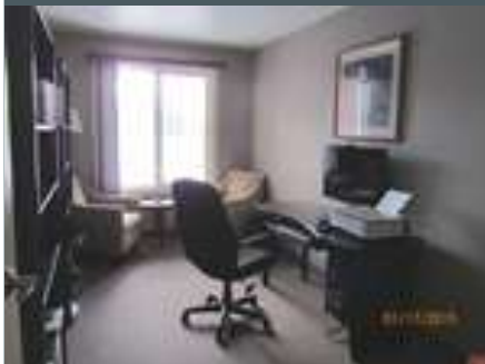
Library and computer room.