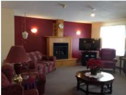
One of the common areas for residents.