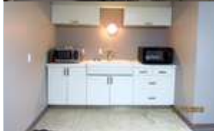
The family room for family gatherings and includes a kitchenette