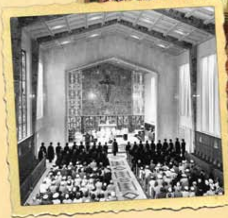
Mount St. Joseph Chapel Opening Ceremonies - June 20, 1954