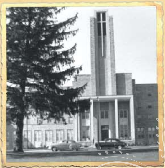
Mount St. Joseph - 1954