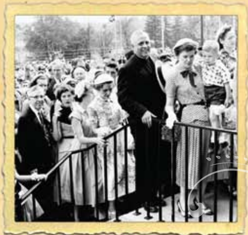
Mount St. Joseph Opening Ceremonies - June 20, 1954